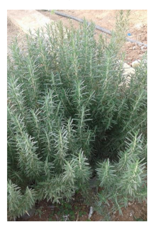
Figure 1. Mature plant of R. officinalis

essential oil constituents in the aerial parts of R. officinalis as a basic research for its application in the future.