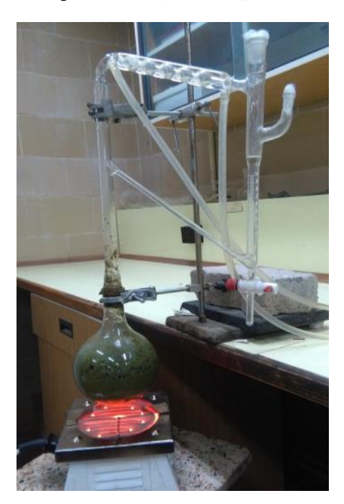
Figure 2. Clevenger apparatus for isolation of R. officinalis essential oil